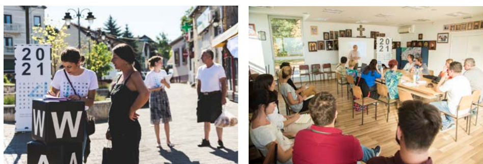
Slika 2. Citizen survey and focus group work

The most important aspect of the participation process in actual creation of the local public space is at the level of the active participants' orbit. Although our local communities has only vague comprehension of the participation practice, and what might be the benefits, the number of those interested to actively contribute to the process, in all phases, was above the expected. The enthusiasm of the involved citizens was boosted by the fact that spaces at hand were actual choice of the local community, so they could easily recognize their interest and problems, as well as potential of the programmes they proposed to enhance quality of life on local scale. Also, the new format of the guided talk in focus groups, the relatively short period of time in which all the phases of the process were executed was essential for high level of enthusiasm between participants, along with strong promises made about actual realization of the space, in near future.