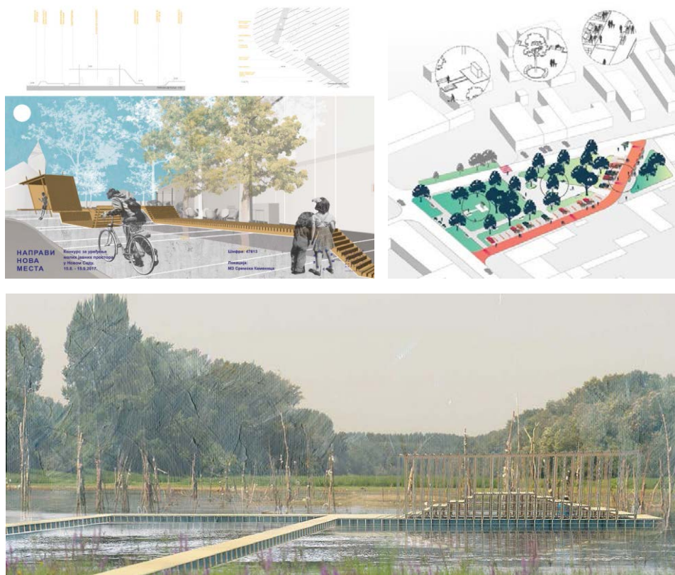
Slika 3. Winning proposals: upper left - "Linear bench + eaves" for the Zmaj Jova Square plateau in Sremska Kamenica, upper right - Drive-through marketplace (park and marketplace space in Kovilj), bottom-Pavillion/pontoon (south Dunavac riverbank)

Finding a solution throughout all aspects of the process of designing a space (from functional to visual): within financial and physical constraints, designer aspirations and requirements of numerous stakeholder groups is the main challenge of urban planning. Participative processes initiated by the Novi Sad ECC 2021 project anticipate new practices in urban planning, which are, sadly, used rather selectively. In contrast to the New Places project, other projects focusing on infrastructural projects do not meet even the basic requirements of sound architectural practice – finding the best solution through open architectural competition call. The participation process itself is, in some cases, formally conducted before, and in other, after the design procurement procedures have already been concluded, with the basis of project specification not reflecting the actual needs of the locality affected.