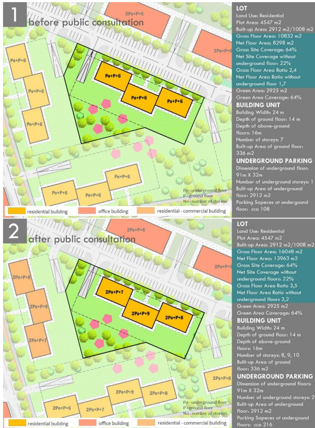
Figure 2. Spatial analysis of the regulatory plan at the lot level

completely changed the land use of the area, converting the fairground complex into a mixed residential and commercial zone characterized by high-rise buildings. Following the public consultation process, as a tool for citizen and stakeholder engagement in the planning process, there has been a noticeable increase in construction density, both in terms of the number of buildings on parcels and in terms of increase in the number of storeys. Comparing the new planning solutions with the existing regulatory plan for the fairground complex [13], it is evident that there has been a significant increase in site coverage and floor area ratio in the new planning document [6]. Furthermore, within the iterations of the new regulatory plan, there is a visible trend of increasing overall built density, as a result of pressure from investors and landowners, which is presented in detail in Figure 2.